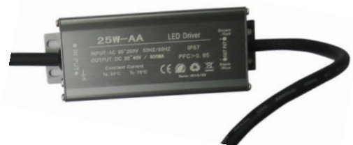
IP 65 Solution