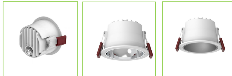
Reflector color options